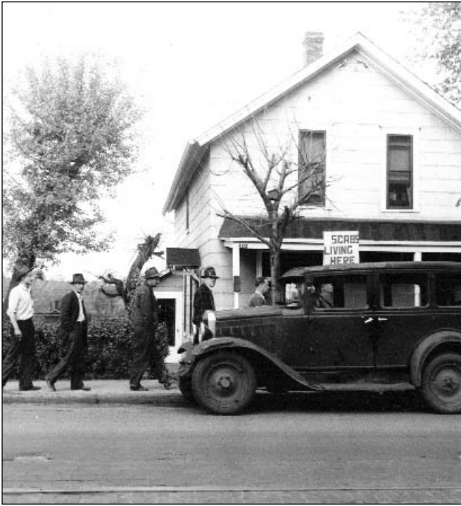
Strikers often picketed outside the home of a person who crossed the picket lines to work.

Chicago Great Western for temporary injunctions against the UPWA. The judge took his seat on the bench and began by setting what he hoped would be not only the tone of these and all subsequent proceedings, but that on the streets outside of the packinghouses as well.