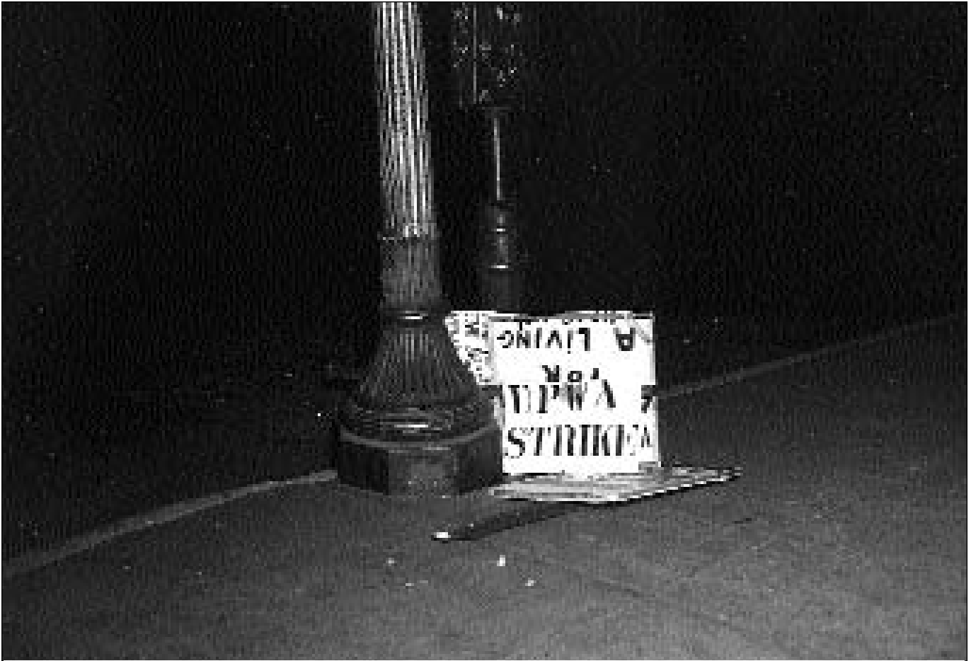
After the strike, abandoned picket signs leaned against a lamppost.