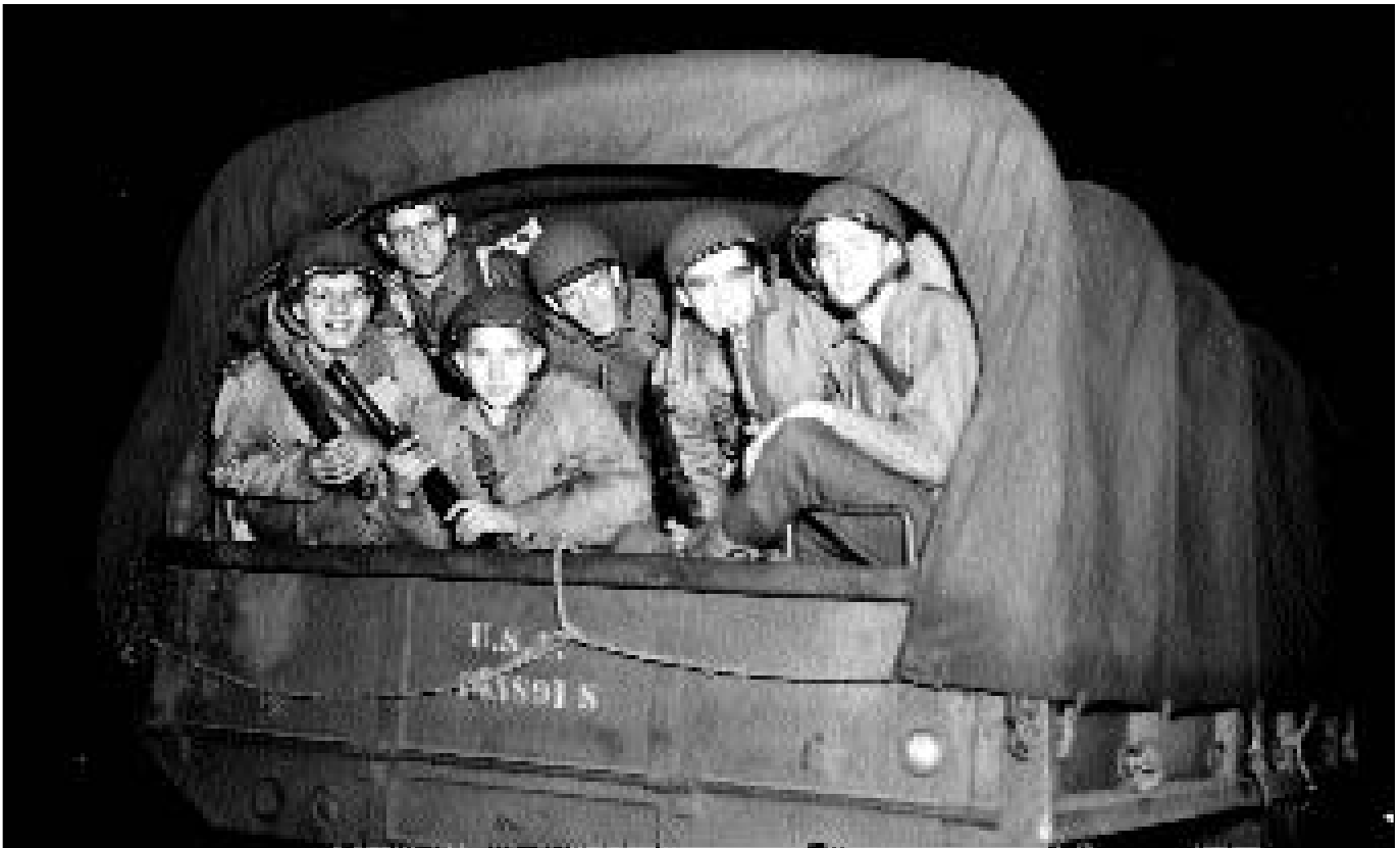
The National Guardsmen who were called in to break up the strike were considerably younger than the strikers themselves.

remarks came as he reconvened the hearing into the Swift and Armour requests for injunctions against the UPWA and continued the growing list of contempt actions against union officials until completion of the injunction cases. Judge Schultz opened the proceeding by reading the state and federal statutes on contempt of court and remarked, "I'm beginning to wonder if some people believe we should have courts or do away with them."