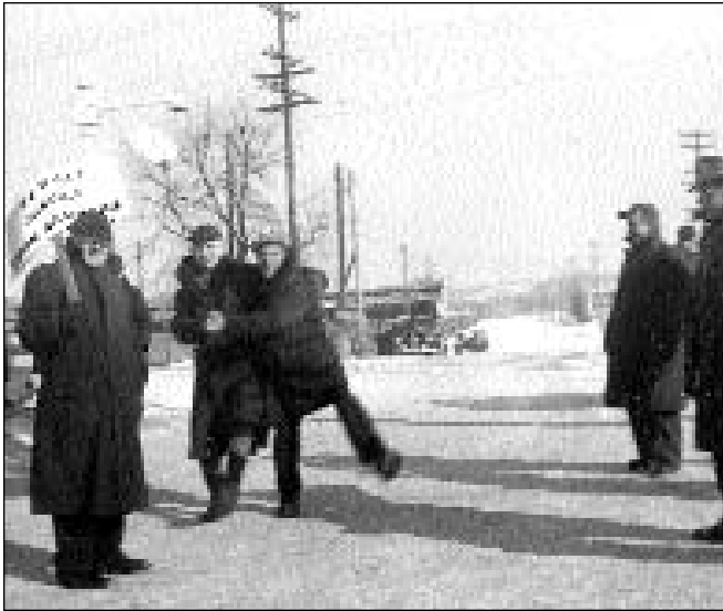
Armour strikers were somewhat playful as the strike began in March 1948.

strike, allowed the packers precious time to prepare, while at the same time, the increased use of court injunctions would place a drain on the union's financial resources through seemingly endless litigation. With the change in the legal and political climates since the 1946 strike, the companies had decided to fight. 20