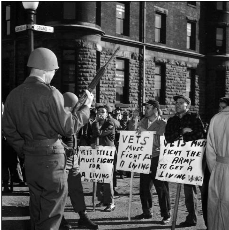
War veterans confronted National Guardsmen on the corner of Grand and Concord.