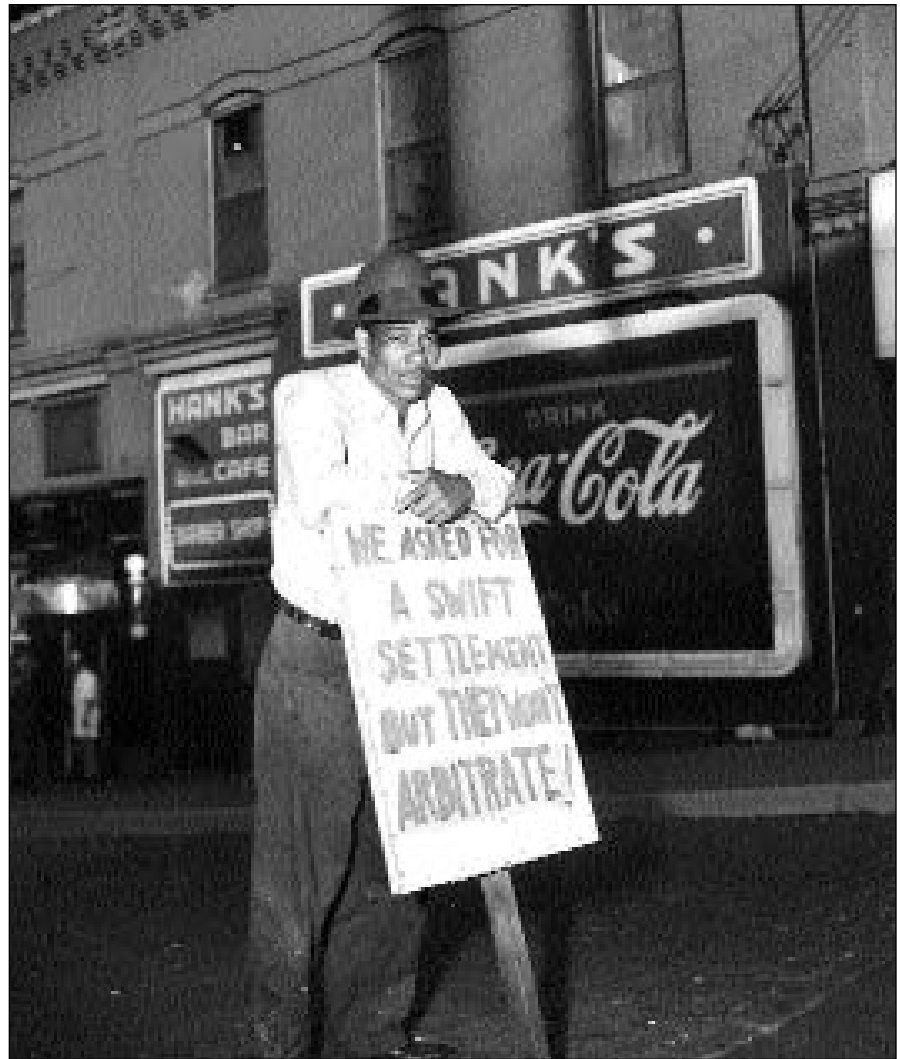
The packing plants at South St. Paul employed people from many different racial and ethnic backgrounds.